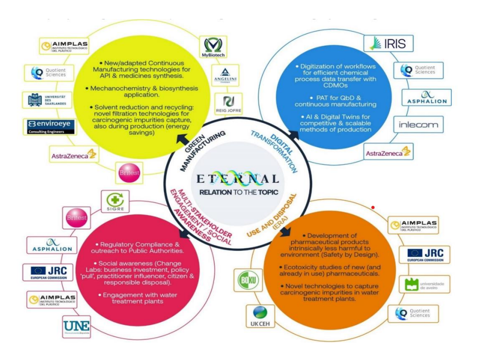
Figure 1. ETERNAL project concept

ETERNAL will contribute to sustainable development of pharmaceutical manufacture, use and disposal, by using and promoting full life cycle approaches covering design, manufacture, usage, and disposal, assessing the environmental risks of not only active pharmaceutical ingredients and residues or metabolites, but other chemicals and by-products of the production process. In other words, safe and sustainable pharmaceutical lifecycles by design. The concept and expected project outcomes are shown in Figure 1. ETERNAL project concept.